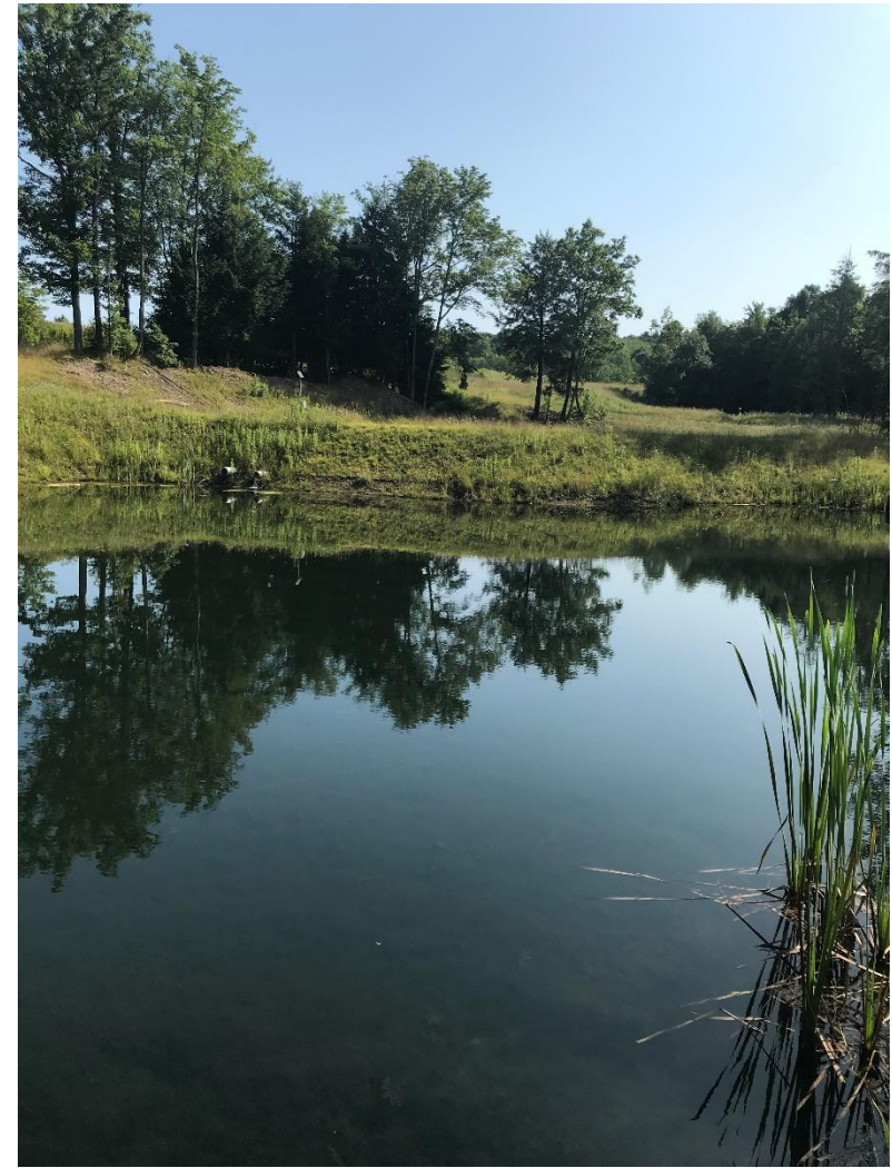
Frog Treatment System – Morgan Run Watershed