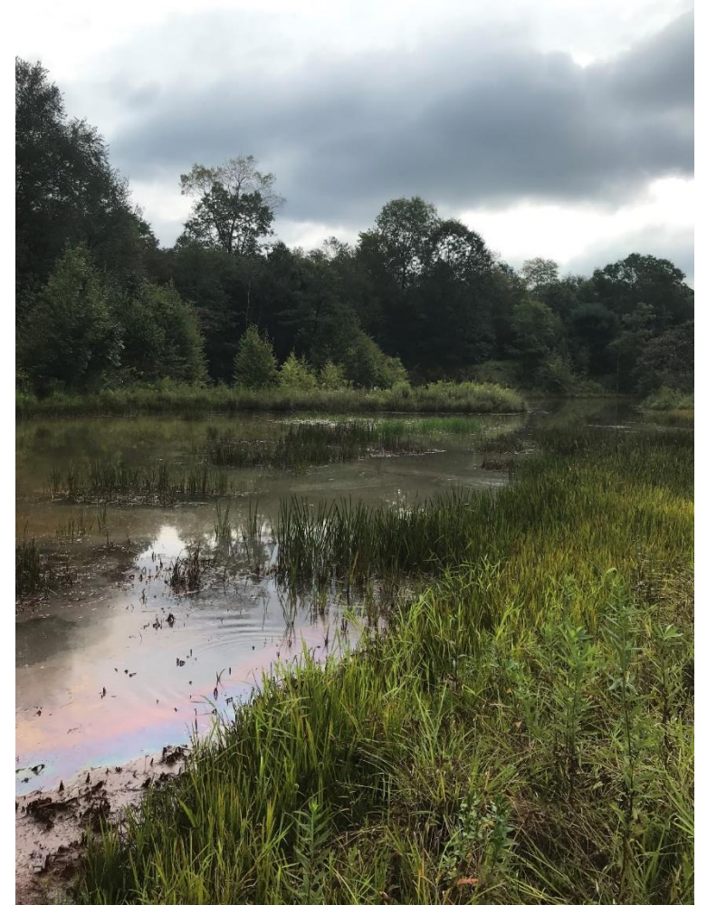
Richards Passive Treatment System – Blacklick Creek Watershed