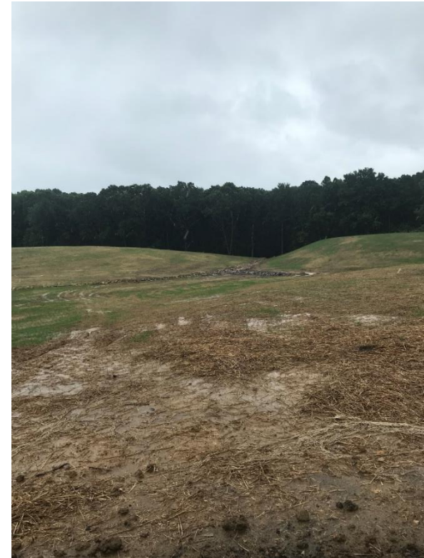
Illesboro Road Land Reclamation – Raccoon Creek Watershed