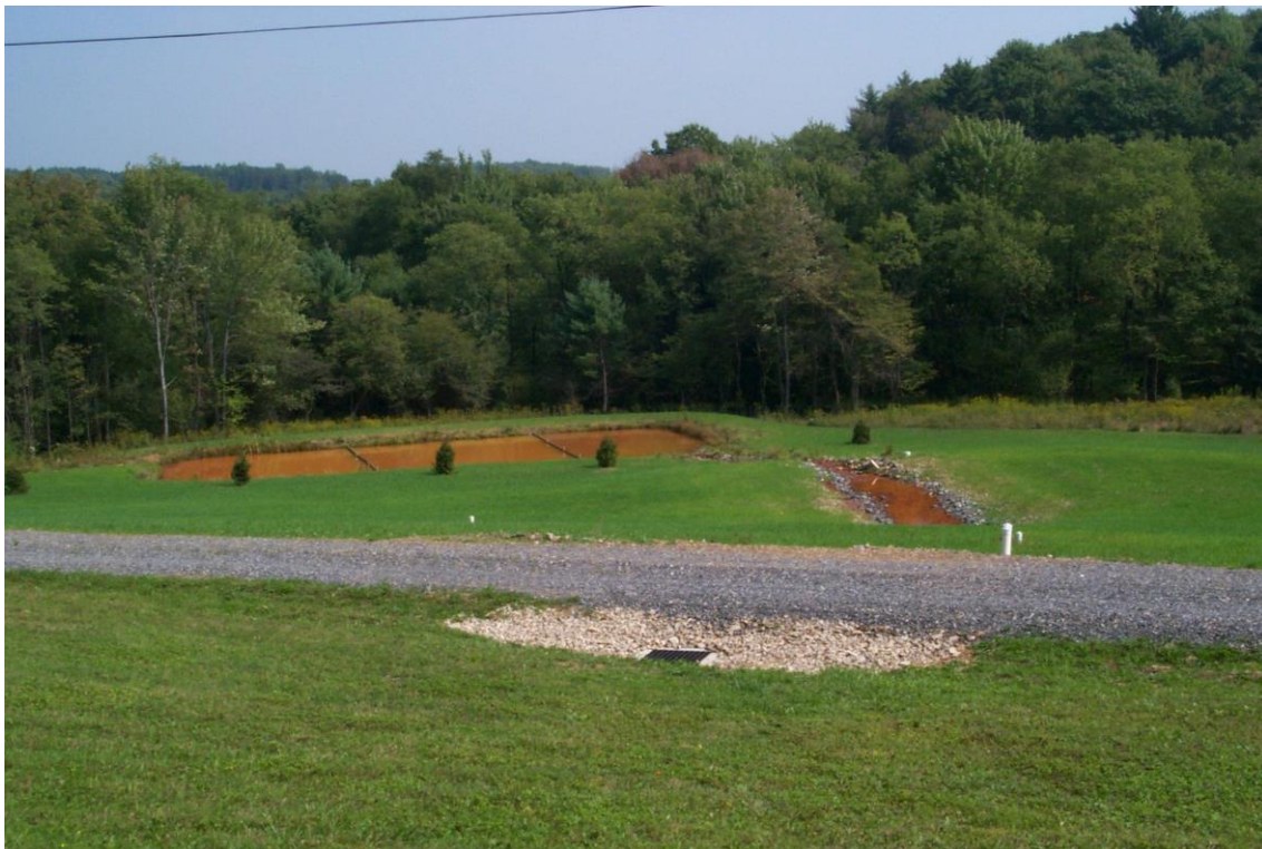
Daiva Passive Treatment System – Mill Creek Watershed