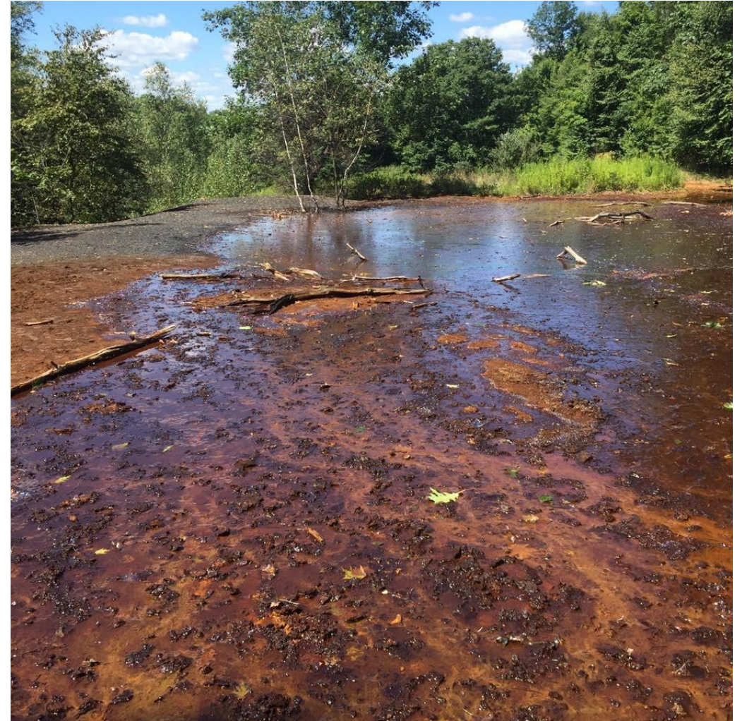
West Branch of the Susquehanna watershed near Shawville PA