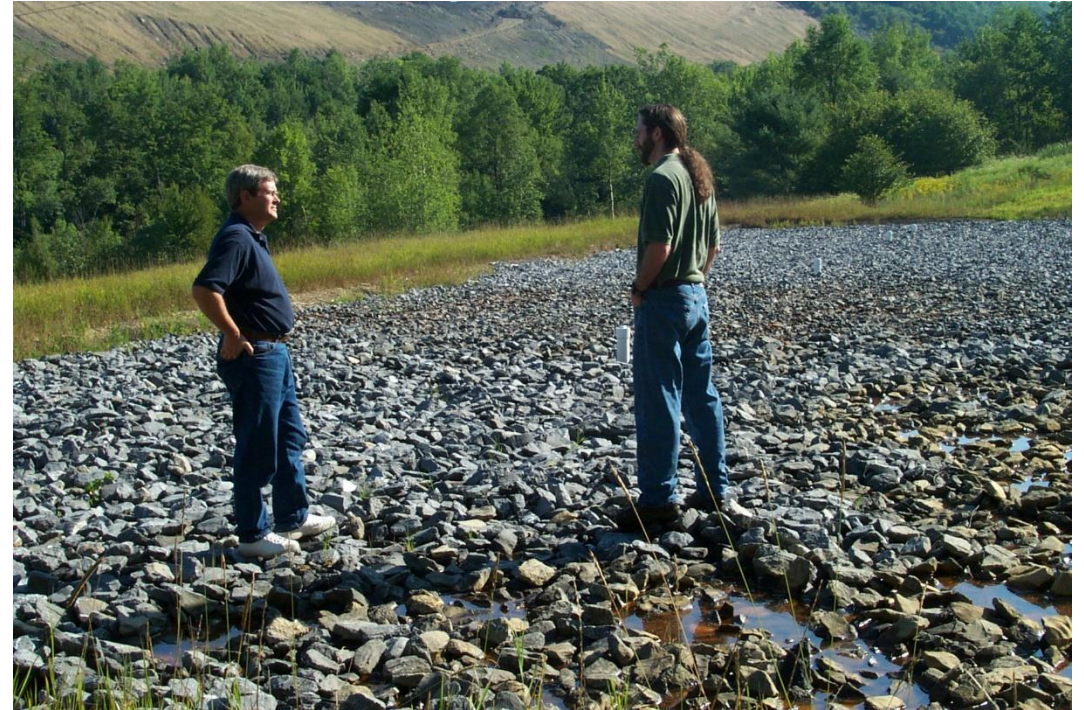
Gavazzi Treatment System – Little Toby Creek Watershed