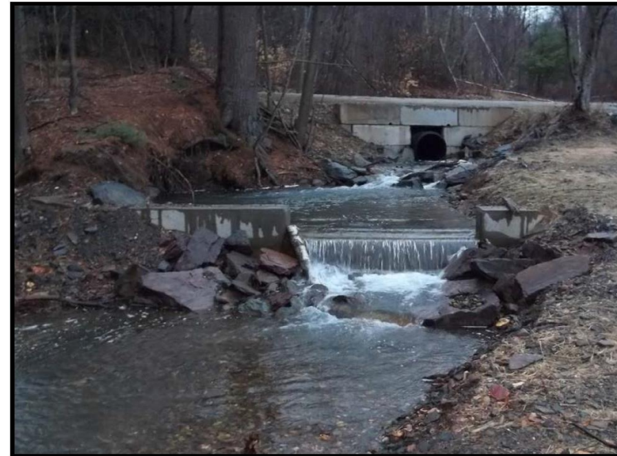
Coal Run System – Schrader Creek Watershed