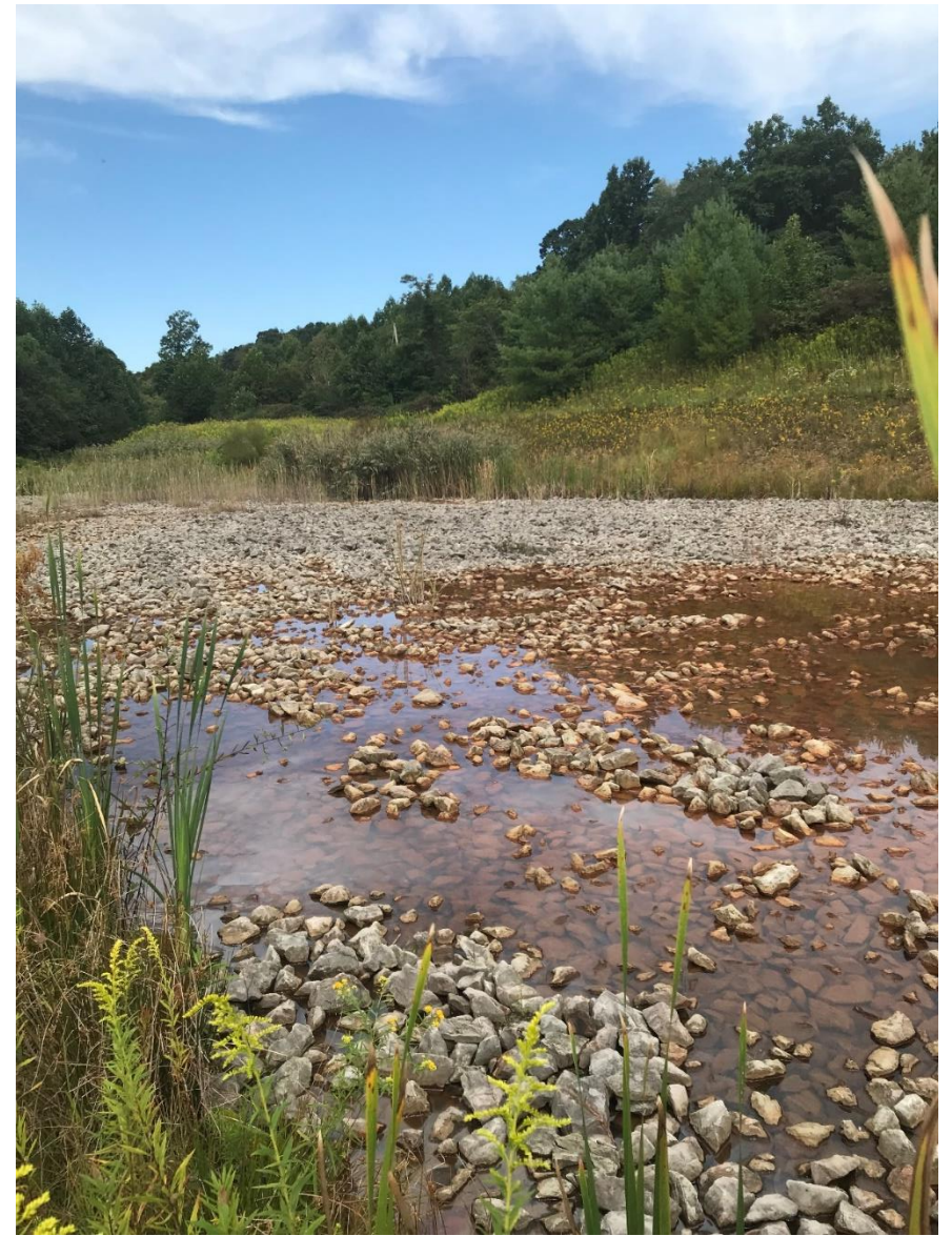
Gallentine Treatment System – Indian Creek