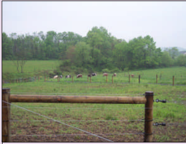
A view of the Woolf Farm streambank fencing project.

Cold May showers didn't stop 25 people from visiting a number of farms in Berks County! The Schuylkill Action Network's Agriculture Workgroup conducted a tour of several farms in the Schuylkill River Watershed. Each farm had been part of a series of projects funded by an EPA grant that provided streambank fencing, livestock crossings, and other technical assistance to participating landowners. Each of the implemented Best Management Practices help to reduce sediment and manure from reaching local streams, and improve the water quality of the Schuylkill River.