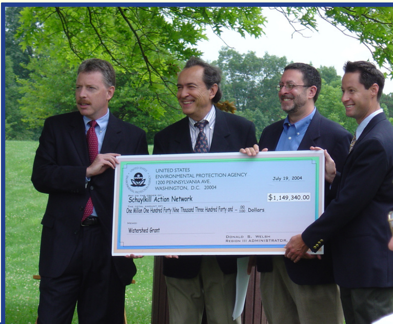
The SAN gets its inaugural funding.

SAN has not shied away from the toughest sources or the historically intractable issues hampering progress in environmental improvement. The many project-level success stories of curtailing acid mine drainage flows through new diversions or treatment systems for abandoned mines stand out to me as key examples of SAN's commitment to innovate and tackle the toughest jobs.